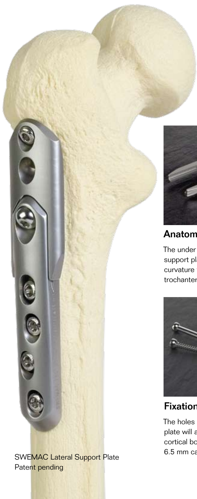
SWEMAC Lateral Support Plate Patent pending

The SWEMAC Lateral Support Plate prevents medial displacement of the shaft relative to the neck and head fragment. A rotationally unstable neck and head fragment can be additionally stabilized with a 6.5 mm selftapping cancellous bone screw inserted parallel to the lag screw.